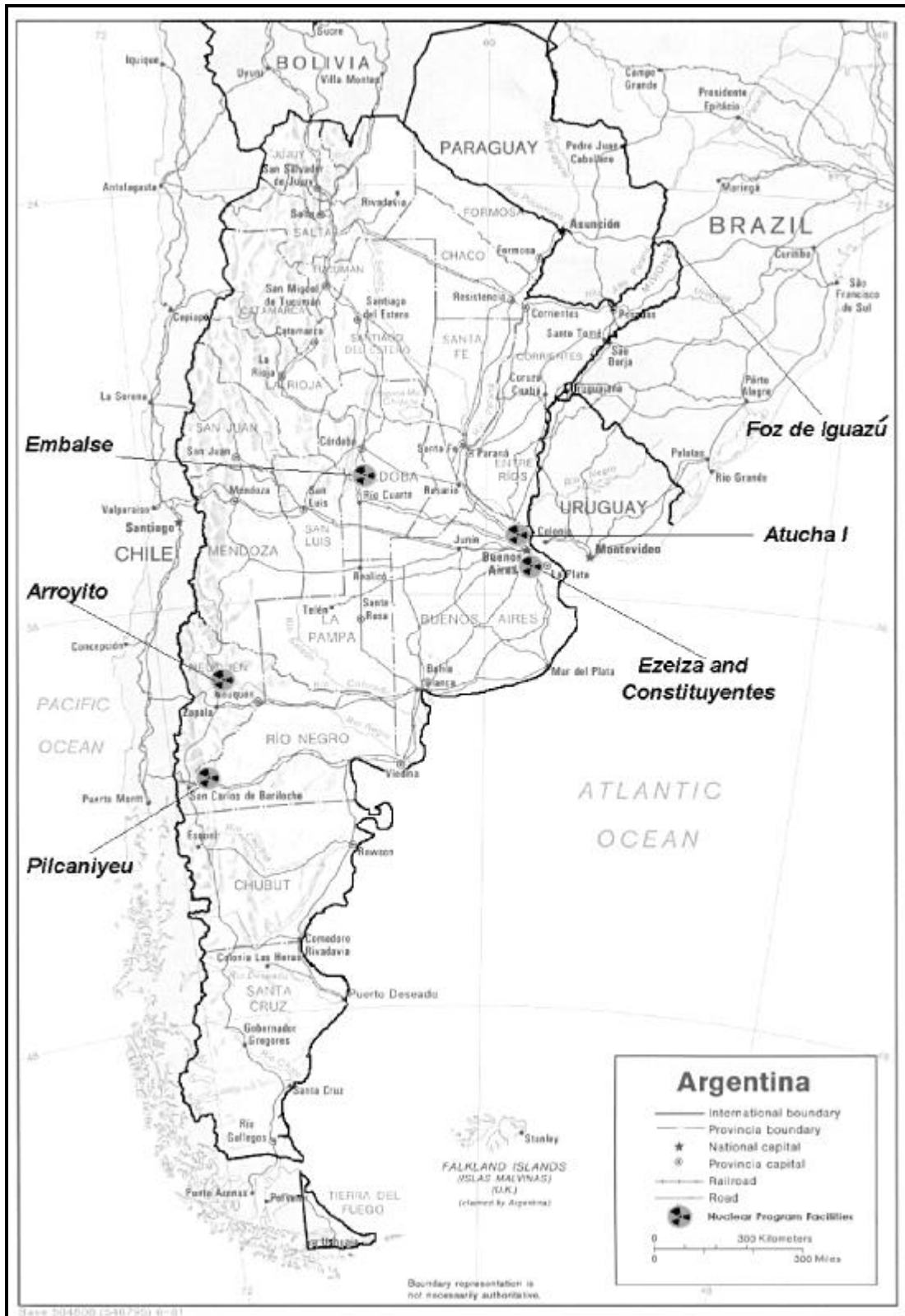
Figure 1: Nuclear Program Facilities in Argentina